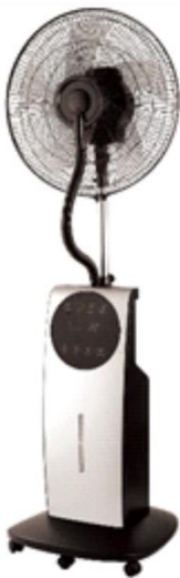
Mist Fan, 16 Inch 220v-240v,50Hz, 90W