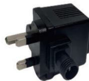
D. UKCA Adaptor (1x)