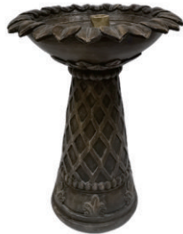
A. Body of Fountain (1x)