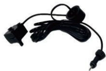
C. Submersible Pump (1x)