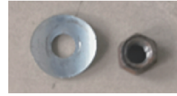
Handrail L rods*2