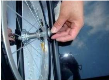
C. on the opposite side put the conical spring firstly, then put on the hub safety washer, screw the conical nut in a clockwise direction onto the QR lever and secure it with the spring and safety washer.