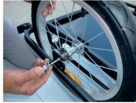
B. insert the quick release into the wheel axle