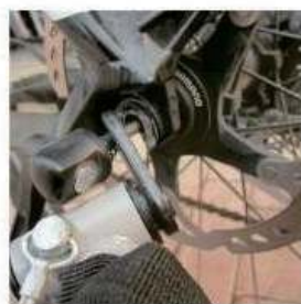
bike with QR