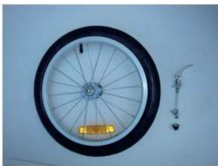
wheel and quick release

Before assembling the wheels into the trailer, we'd like to introduce you the previous work.