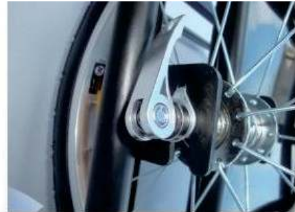
D. Make the both side of the hub safety washers hanging in the holes of the brackets. tighten the quick release.

WARNING: wheels must be properly installed. If wheels are not properly locked into the bracked and securing levers axes do not firmly in place the wheels could fall. Consult a specialist cycle if you have any doubt before use.