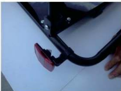
Step four: Rotating the red reflector bracket toward back, should be in the positio as picture

WARNING: wheels must be properly installed. If wheels are not properly locked into the bracked and securing levers axes do not firmly in place the wheels could fall. Consult a specialist cycle if you have any doubt before use.