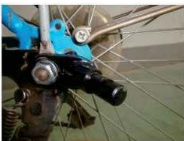
bike with axle

Step five;connecting the trailer to the bike