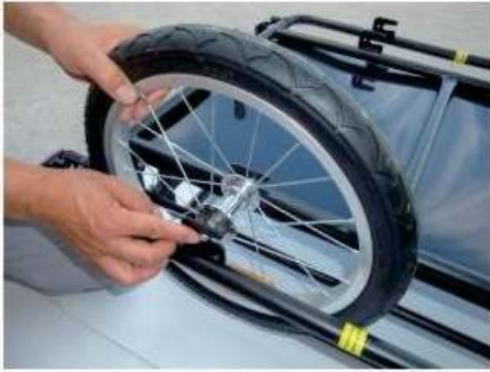
A. put the wheel into the frame as picture