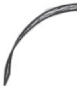
D x 1