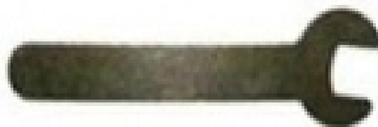
G x 1