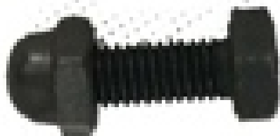
F x 10 +1(spare)