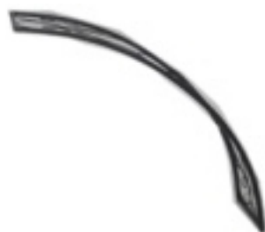
E x 1